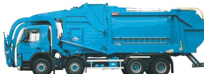
EURO HALF PACK